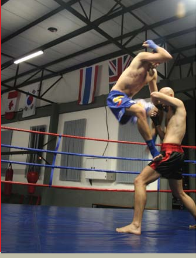
Tao # 8

Punching works the same you need just enough tension in the right place to initiate the punch and to relax in the exact right time to move the punch at the speed of light and to tense up again at the point of impact to destroy the target always aiming a few inches behind the target.